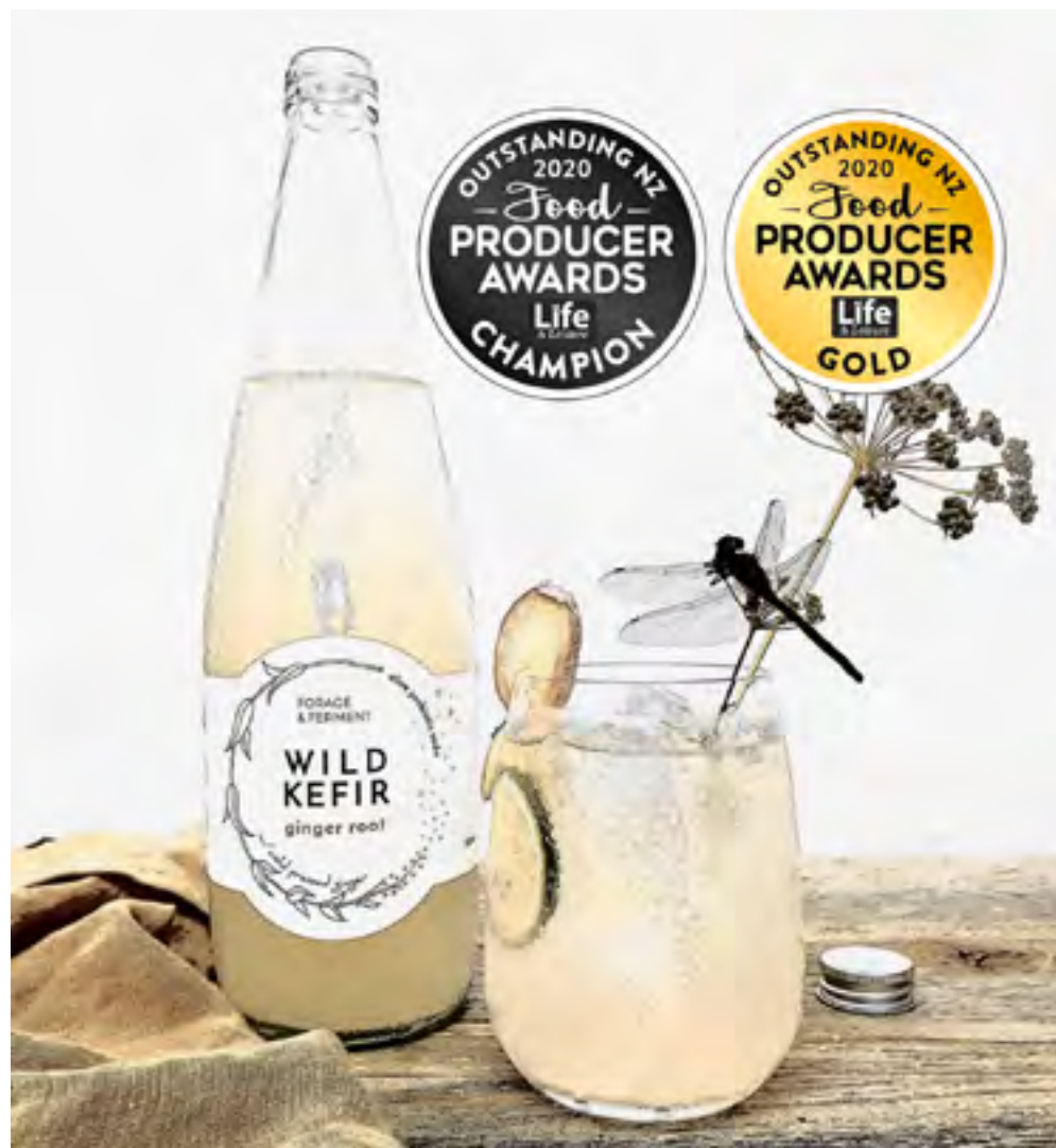
Forage & Ferment's Wild Kefir ginger root drink won the Champion Drink title at the national Outstanding Food Producer Awards. Be in to win a taste of this Clevedon-brewed beauty by entering our Reader Giveaway - details below.

Both Clevedon Herbs & Produce and Forage & Ferment sell their products at the Clevedon Farmers Market.