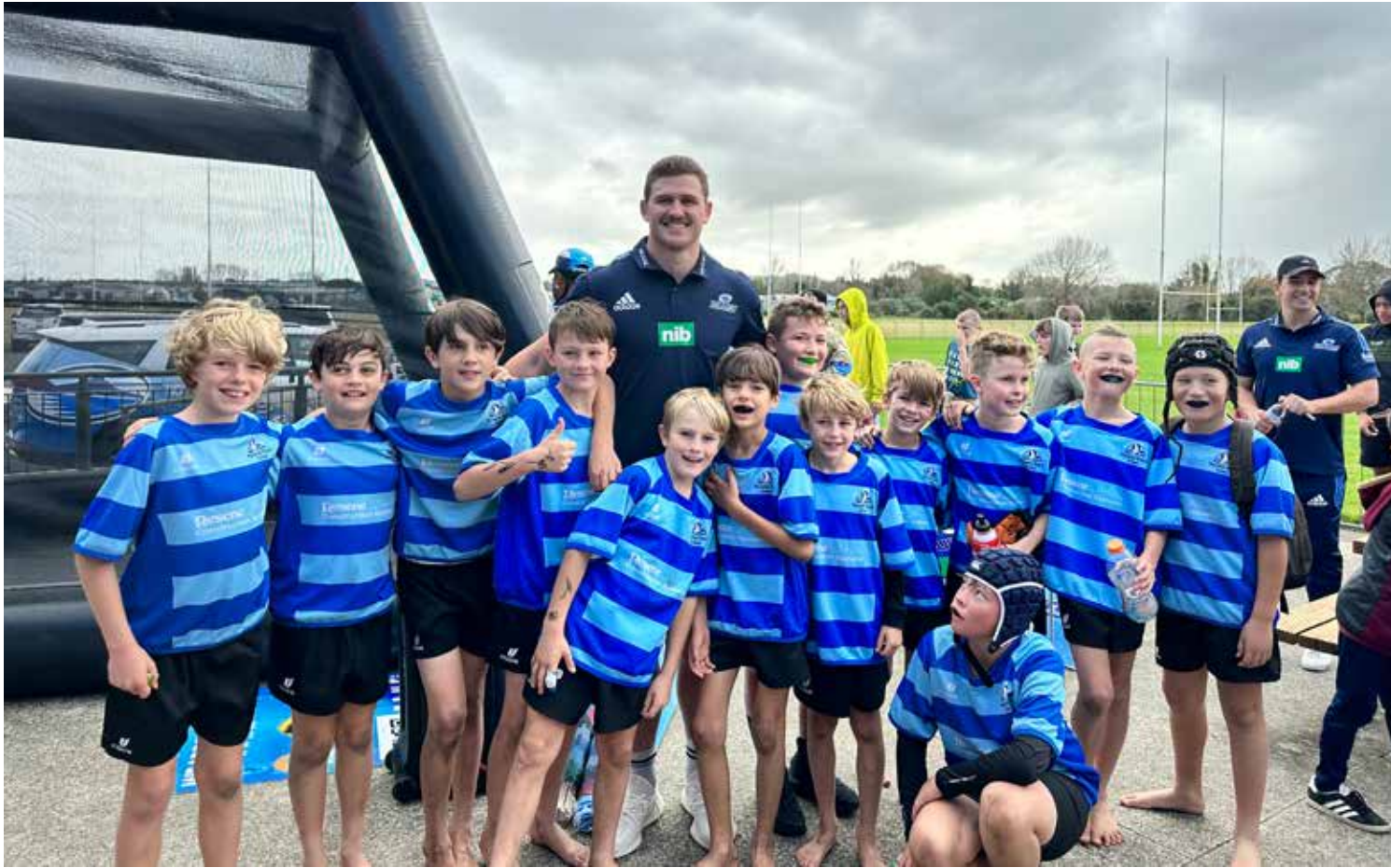
Maraetai Beach School boys' Year 5/6 rugby team will play at Eden Park on Friday night.

This Friday 2 June will be one to remember for a team of young local rugby players.