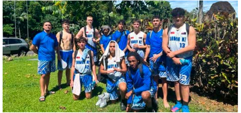
The NZ Samoa U17 basketball team.