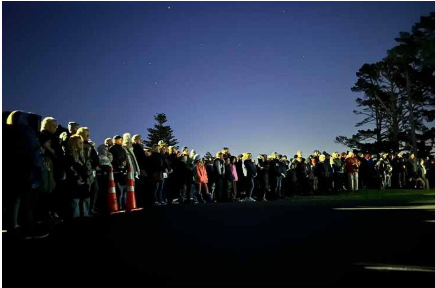
Coast residents gather at the Beachlands Dawn Service to remember those who served our country. More photos page 6.

Last Tuesday hundreds of local residents paid tribute to those who have served in defense of our country.