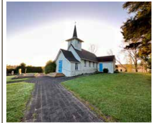
Clevedon All Souls Church will host the second of its concert series this Sunday.

The second of the Sanctuary at St James concert series plays this Sunday in Clevedon.