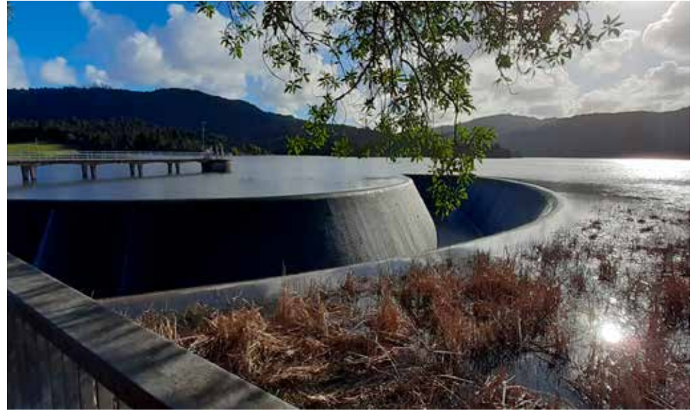
A wet summer means Watercare's Hunua dams are already at capacity heading into winter.

"This summer we have carried out flushing operations at Cosseys and Wairoa dams in mid January and late February. We had a flush scheduled in mid-February but postponed it because