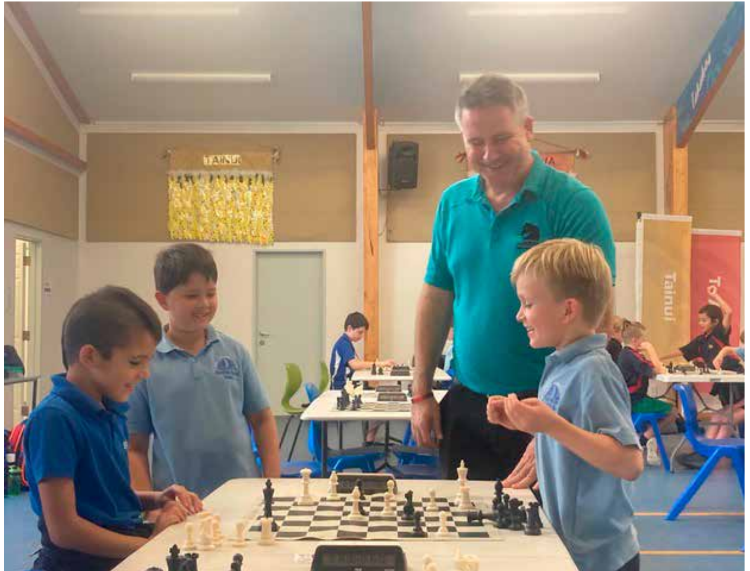
Right: Students from local schools battle it out over the boards.