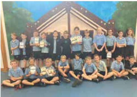
Above: The Maraetai Beach School chess team has made it through to the regional schools tournament to be held later this month.

The team will now progress to the Auckland Regional Tournament to be held on 26 July at Baverstock Oaks School.