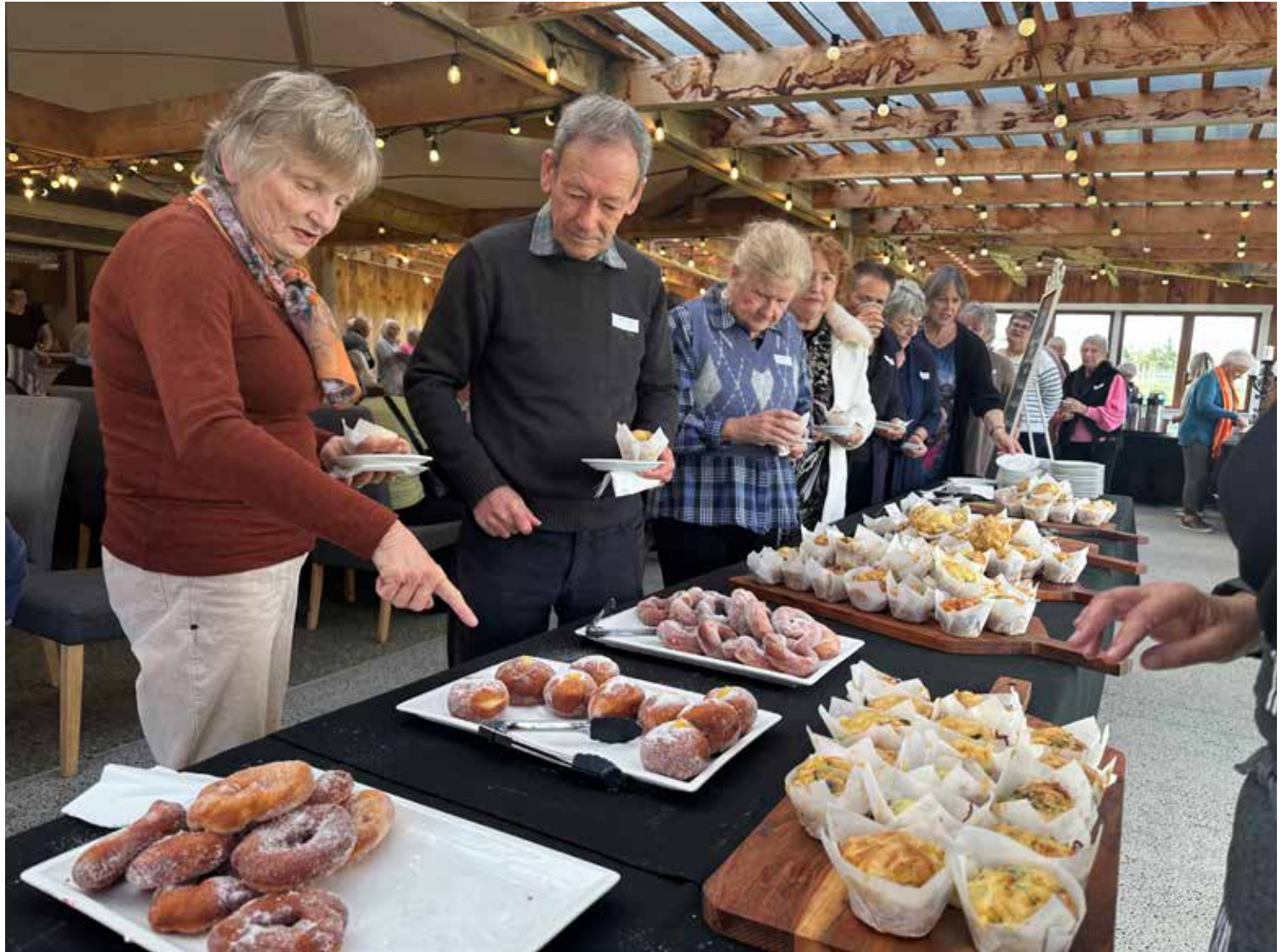
Silver Tones members line up for a hearty morning tea of muffins and doughnuts at Turanga Creek Vineyard.