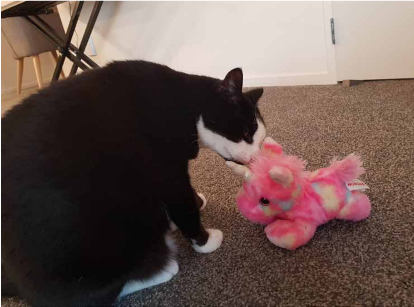
Vesting proudly displays one of his illegally procured treasures.

He's Beachlands' answer to Slinky Malinki - meet Vesting, the Pōhutukawa Prowler.