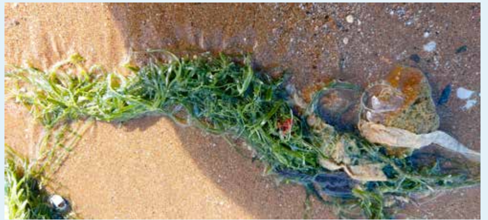
Caulerpa brachypus (also known as Sea Mustard).

In the United States, near-shore reefs where it has now taken over have become so overwhelmed by the Exotic