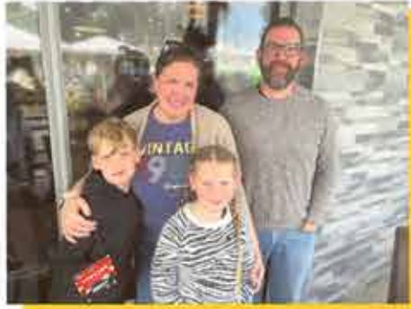
"What did the buffalo say to his son when he waved goodbye? Bison."

As always, this giveaway wouldn't have reached the heights it did without the amazing support of some local businesses. Sunkist Bar + Kitchen, Rydges Formosa Golf Resort, and Koki Kitchen generously contributed towards this prize pack.