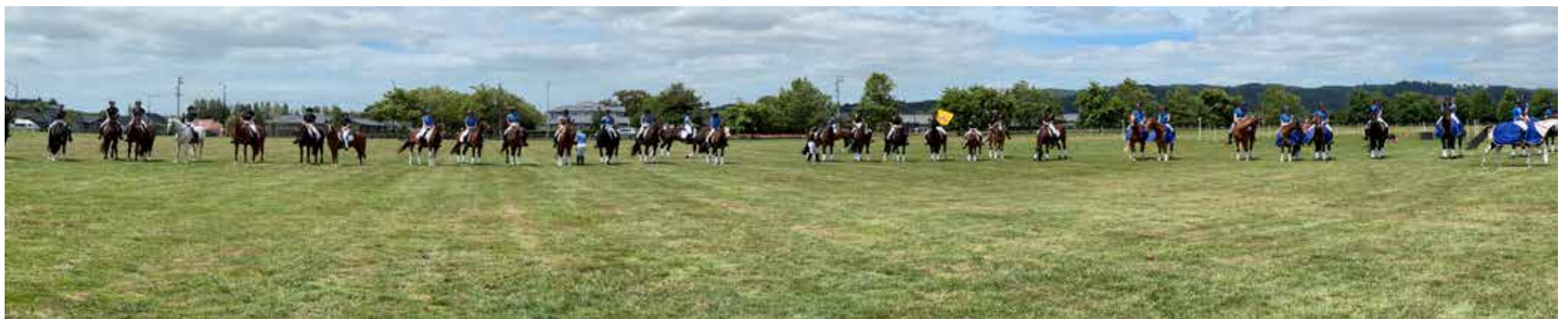
Clockwise from top left: The Auckland Area dressage team placed sixth overall; Clevedon Pony Club showjumper Hayley Newington; riders from teams around the North island assemble at the dressage prizegiving event at Clevedon Showgrounds.