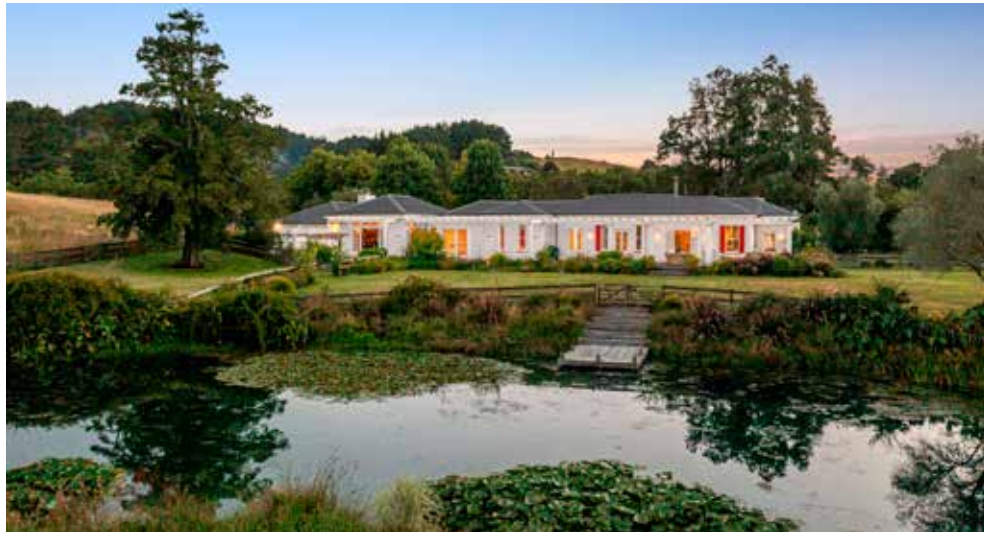
This historic homestead located on Sutton Road, Brookby, is on the market.

In 1996 the house was moved to a 13-hectare property in Brookby where it resides today, with its high stud ceilings, veranda overlooking the large lily pond