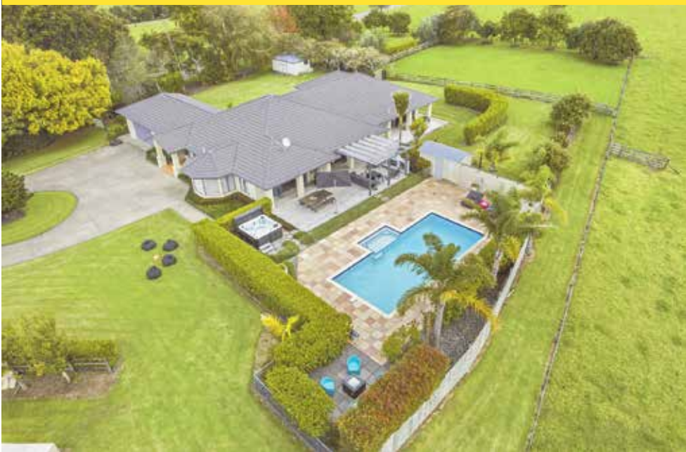
81 Whitford Park Road, Whitford - Sold April 25, 2023

Sale Price: $3,200,000 Days On Market: 12 Conjuncting Agency: Ray White Howick