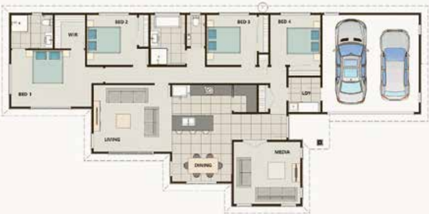
Floor Plan © G.J. Gardner Homes 2025