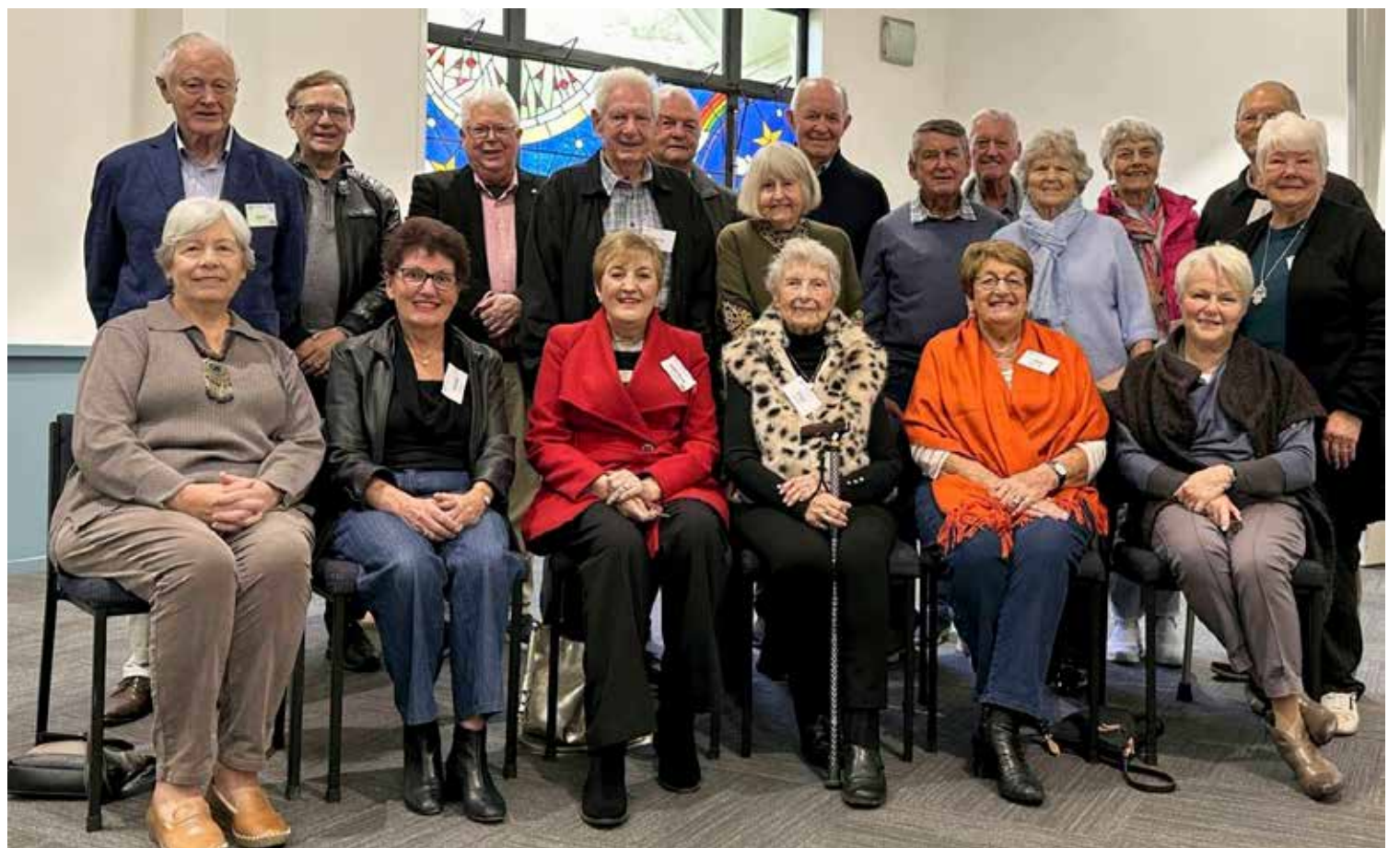
The local u3a club now has 21 sub-groups which explore a wide range of interests and hobbies.