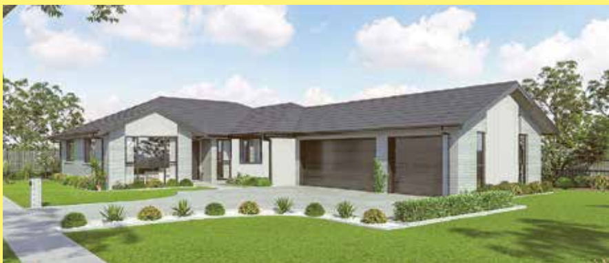
3 Car garage family living in Beachlands Lot 29 Seventh View Avenue, Beachlands from $1,539,000*

With our turn-key finance option on House and Land packages, you pay 10% now and the remainder when your home is complete.*