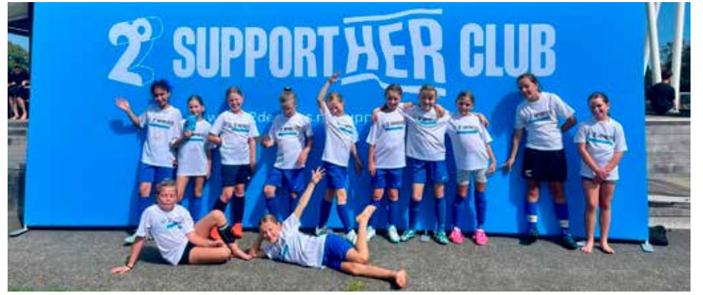
BMAFC's 'Blue Flames' team at the SupportHer Football Festival.

Young players from Beachlands Maraetai Association Football Club (BMAFC) took part in the SupportHer Football Festival, held at Keith Hay Park on Saturday 28 March. The event, hosted by Auckland FC and 2degrees, aimed to encourage more girls to get involved in football and build confidence through fun, inclusive experiences.