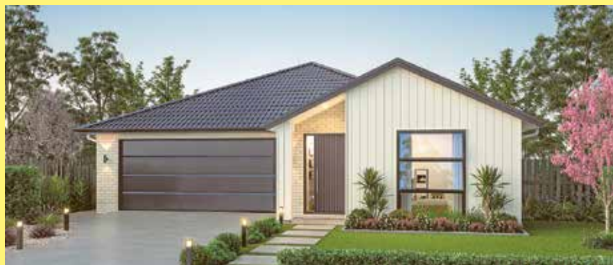
Charming custom home in Clevedon Lot 56/4 Pureirei Drive, Clevedon from $1,315,000*