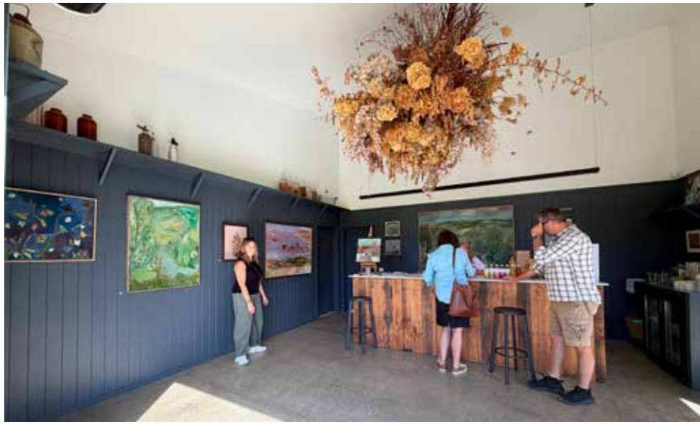
Top: Ginny Fisher's artwork, displayed at The Wild Fermentary.