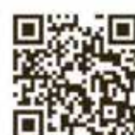
Scan to see more photos