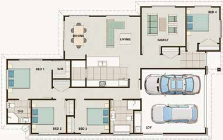
Floor Plan © G.J. Gardner Homes 2025

Lot 29 Seventh View Avenue, Beachlands from $1,495,000*