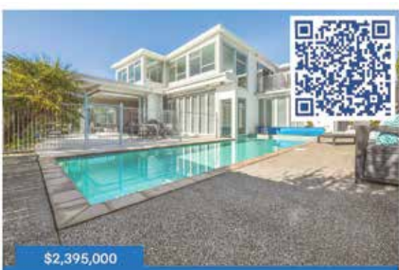
Beachlands 32 Intrepid Crescent