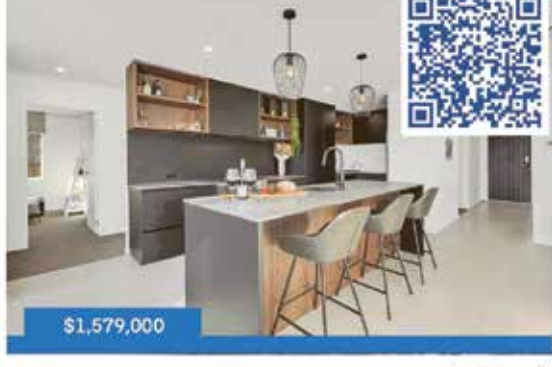
Beachlands 59 Jack Lachlan Drive