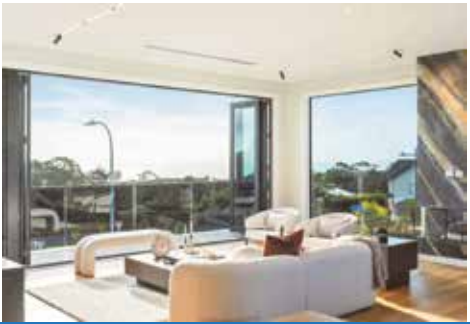
120 Maraetai School Rd Maraetai