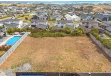
22 Motukaraka Beachlands