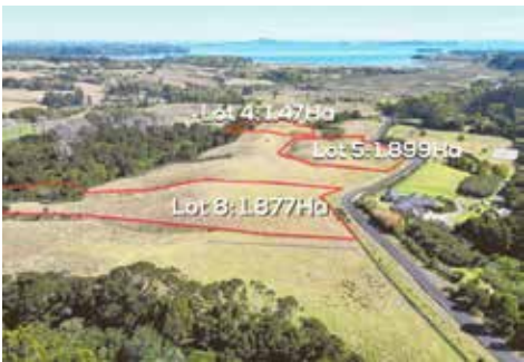
11 Waikopua Rd Whitford