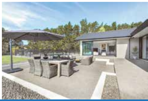
671 Whitford-Maraetai Rd Beachlands