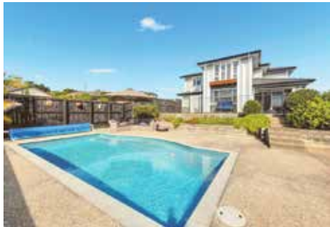
44 Liberty Cres Beachlands