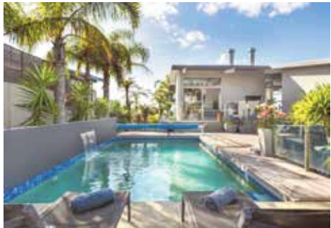
8 Intrepid Cres Beachlands