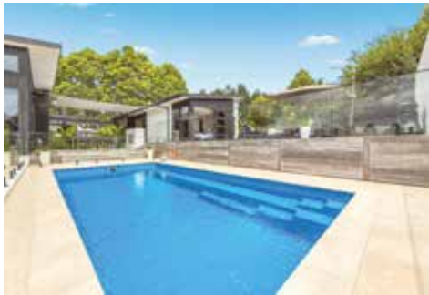
79 Whitford Park Rd Whitford