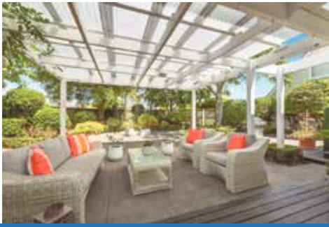
6 Pohutukawa Rd Beachlands