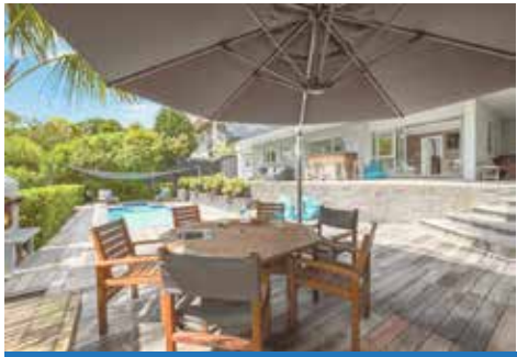
27 Omana Heights Dr Maraetai