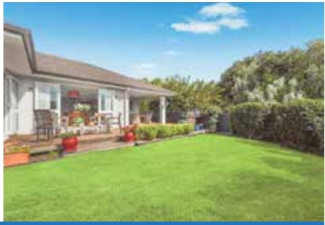
40 Liberty Cres Beachlands