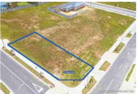
11 Kowaitau Ave Beachlands