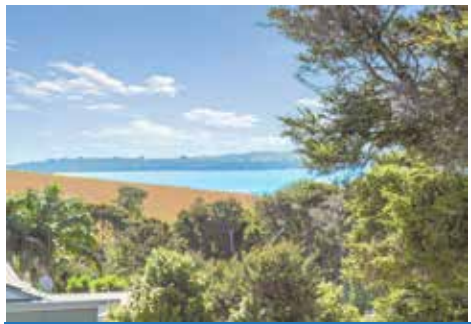
35 Te Puru Dr Maraetai