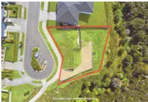
23 Cadwil Dr Beachlands