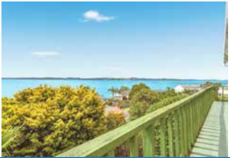
38 Te Pene Rd Maraetai