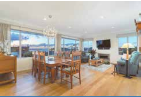
36 Pine Harbour Pde Beachlands