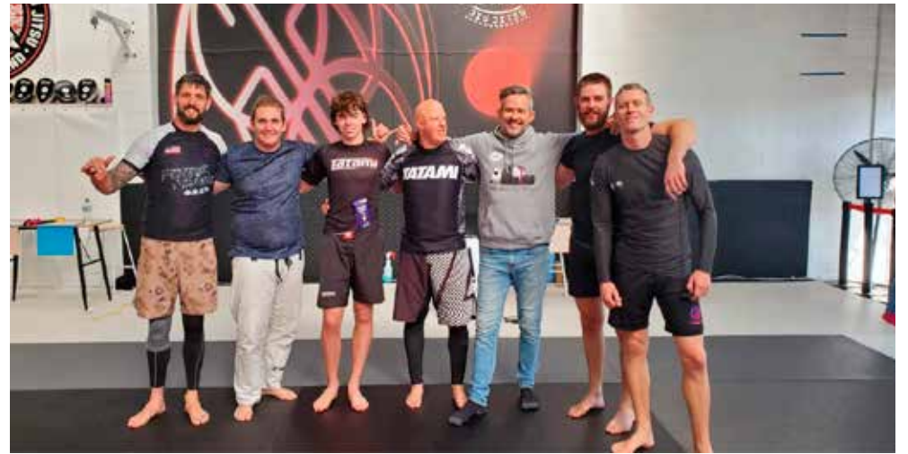
The Mellow Brazilian Jiu Jitsu Academy team.