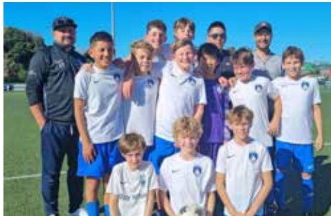
Above: U12 Blue team

Blue U9 played Metro FC Whangamata U9 POD Kaden Govind White U9 played Fencibles United White U9 No POD submitted Black U9 played Central United FC Meteors U9 POD Joshua Red U9 played Waiheke United AFC Gorillas U9 POD Rocco Laing Black U10 played Bay Olympic Jaguars U10 POD Izak Blue U10 played Bay Olympic Comets U10 POD Fletcher Terry Black U11 played Central United FC Leopards U11 POD Jenson Coupe Blue U11G Orcas were to play Auckland United FC Wildcats U12G, defaulted Blue 11 played Metro FC Lightning U11 No POD submitted White U11 played Central United FC Panthers U11 No POD submitted Black U12 played Fencibles United Chelsea U12/7 POD Noah Lukac Blue 12 played Bucklands Beach AFC 11/12 Yellow POD Elijah Matson Blue U12G Diamond Cats played Eastern Suburbs AFC White U11G POD Claudia Farrell U14G drew with West Coast Rangers FC U14 G Black 1-1 POD Bianca Smith Blue 14/3 lost Central United FC Coyotes U14/3 2-3 POD Ryan "Rhino" Walton U16G/2 lost to West Coast Rangers FC U16 G Academy 2-8 POD Frankie Rebels M40/4 beat Clendon United M40 Chiefs Div5 2-1 POD Brendon Kerwick Legionnaires M40/3 beat Manukau City Ba 2 M40 2-0 match abandoned Coasters M40/4 lost to Manurewa AFC Drifting Kites M40 0-1 POD Stephen "Poacher" Parnell Lions M45 beat Uni-Mount Bohemian AFC HART M45/3 2-0 POD Mike Peters Beachlands Maraetai WCL lost to Bay Olympic WCL 0-3 POD Paige Rowe