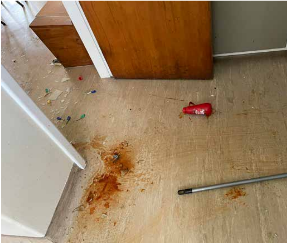
Above and right: offenders smashed glass and made a general mess of the Whitford Domain Pavilion over King's Birthday weekend.