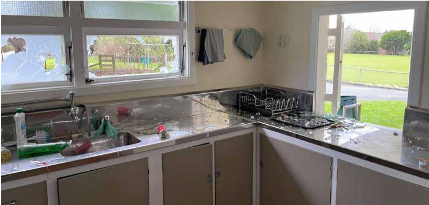
The Whitford Domain Pavilion (above) was vandalised and local businesses targeted in a crime spree over the recent long weekend. Story on page 3.