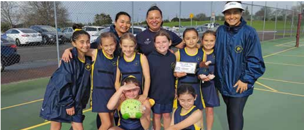
Above - top to bottom: J2, Yr 6 Fantails, Y5 Kiwis