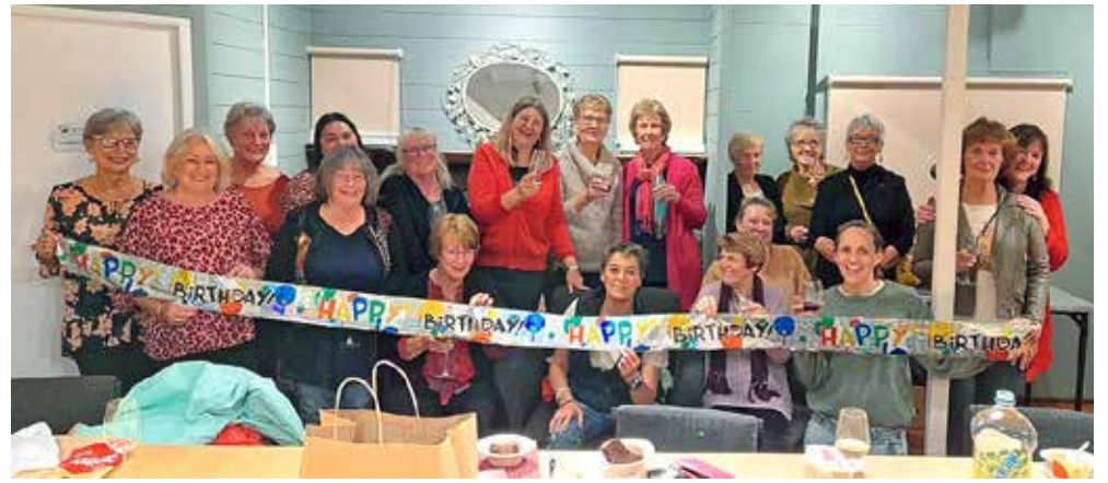
The team from Coastal Treasures celebrate the shop's fourth birthday.

- "We love the fact that the money we make in the shop goes back into community projects through this little shop