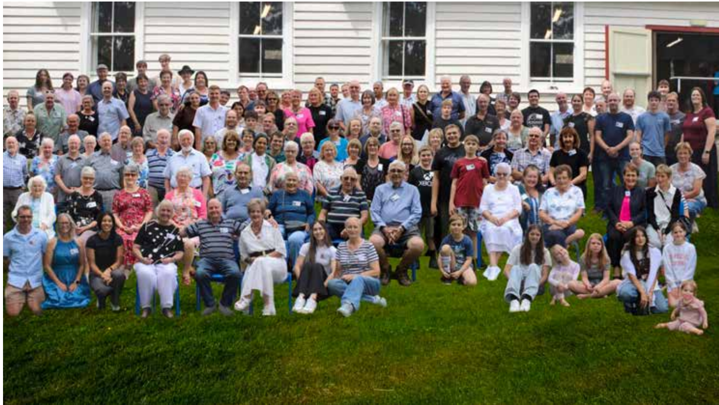
Descendants of some of Whitford's earliest European settlers gather to share family memories at the Whitford Hall.

One hundred and thirty members of the Wade family gathered at the Whitford Hall for a family reunion on Saturday 7 March.