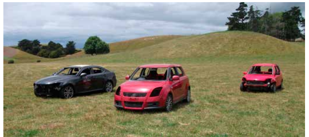
Top photo: Venturer ’26 UV light party. Bottom photo: Venturers learned to drive manual cars, and carry out mechanical repairs on old cars.

was super friendly and I made heaps of stronger connections with my existing new friends over those 10 days and built friends as well.”