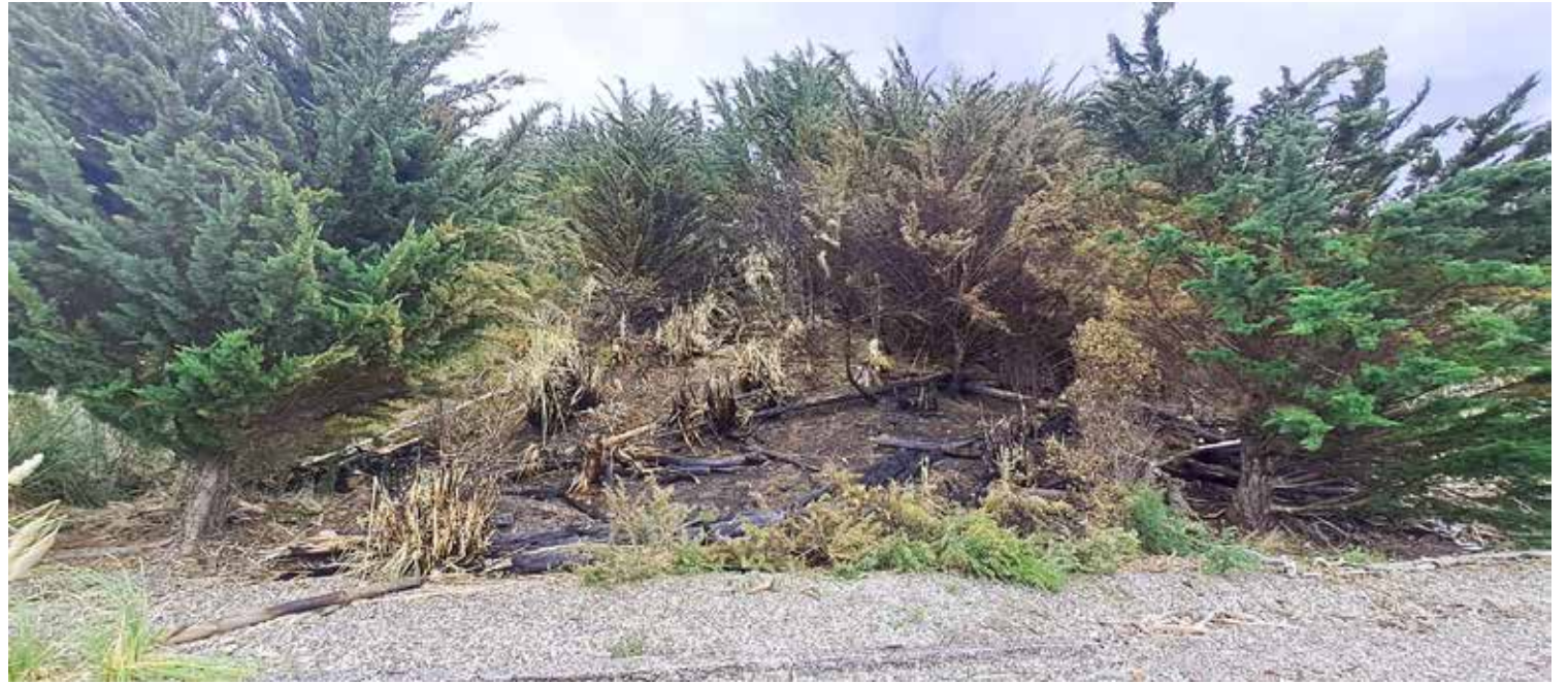
The aftermath of the recent fire at Waitawa Regional Park.

Auckland Council's Regional Parks team is working with New Zealand Police to consider charging a group of fishermen who allegedly started a recent fire at Waitawa Regional Park.