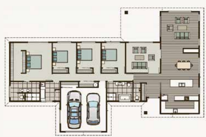
Floor Plan © G.J. Gardner Homes 2023