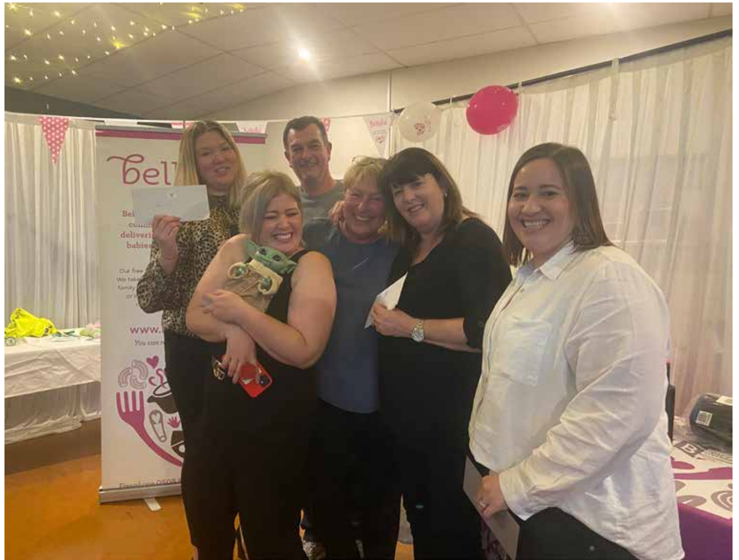
The Cupid Stunts team (above) took out first prize at the recent Bellyful Quiz Night.

Allfit Gym, Ambrosia, Beachlands Suprette, Caci Clinic, Coastal Treasures, Creations Hair Design, Digginit, Dominos Beachlands, The Franklin, Gedge Tank Cleaning, Hello Banana, Lime Tree Cafe, Marina Dentists, Maraetai Boating Club, Mitre 10 Beachlands, Natter and Stitch, No 5 Whitford, Paul Taylor Jeweller, Pepperjacks, Pine Harbour Eatery, Pohutukawa Coast Vets, Pohutukawa Pharmacy, Post & Lotto Beachlands, Ray White Beachlands, Rydges Formosa, Sisters Hair Salon, Sunkist Café, Super Liquor Beachlands, The Stables, Turanga Creek Vineyard, Wetazz, Whitford Merchants, Z Energy, Johnny Bright Apollo Auctions, Beachlands Chartered Club, Ray White Beachlands.