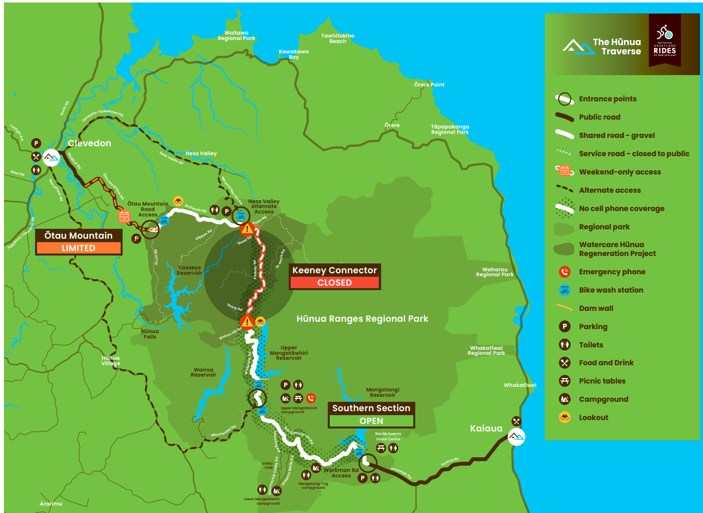
Map showing sections of the Hūnua Traverse cycle trail which will open to the public this weekend.

Following years of planning, hard work and delays, the brakes are finally off the Hūnua Traverse cycle trail. Two sections of the route will open this Saturday 1 July.