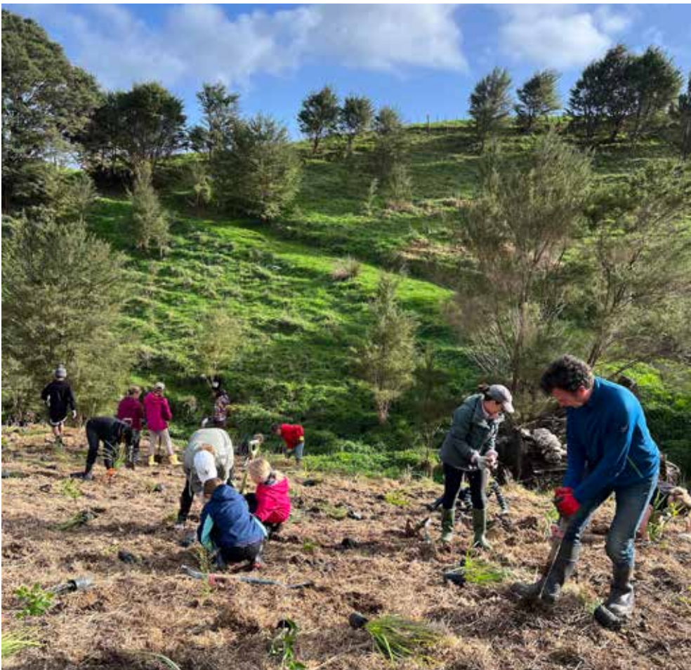
Ellerslie School students help plant over 700 native plants at a Brookby property.

Trees for Survival (TFS) has carried out a number of large scale plantings on farmland in rural south-east Auckland, and says it is still looking for more sites to plant. TFS schools have been hosted at numerous properties in the area this season including Clevedon, Brookby, Whitford, Maraetai and Hūnua. Trees for Survival partners with schools, which raise native plants within school nurseries. All trees planted out are eco sourced from their respective ecological districts, so are set to thrive in their environment. Once mature enough for transplanting, the plants are donated to landowners who are looking to benefit the local environment by enhancing biodiversity, creating habitats, stabilising land and protecting waterways. School communities get involved by helping plant the plants on landowner’s land, giving students hands-on experiences which help them learn about the positive actions they can take to support their environment. With 3-4 weeks of the planting season still to go, Trees for Survival’s 2025 stats across Auckland so far are: • Plants grown and planted - 43,308 • Landowner plants planted - 2,210 • Total planted - 45,438 • 1,611 rangitahi involved in planting days • Total planting day participants 2,069 • Waterways planted - 9,012m